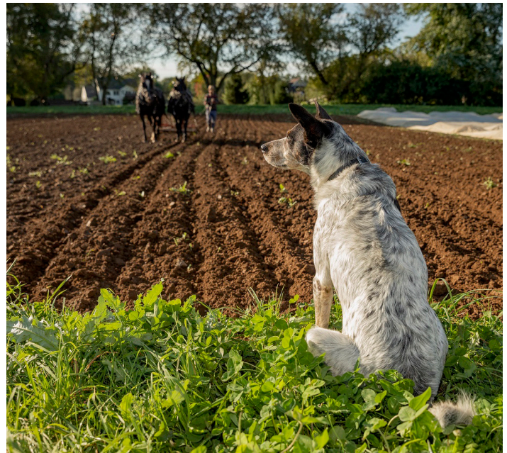
Farm dog Rocco surveys the freshly draft-horse cultivated alley cropping site

Nettle, comfrey, horsetail, mountain mint, borage, lemon balm, asparagus, elderberry